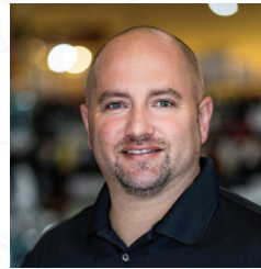
Mat Dinsmore Wilbur’s Total Beverage