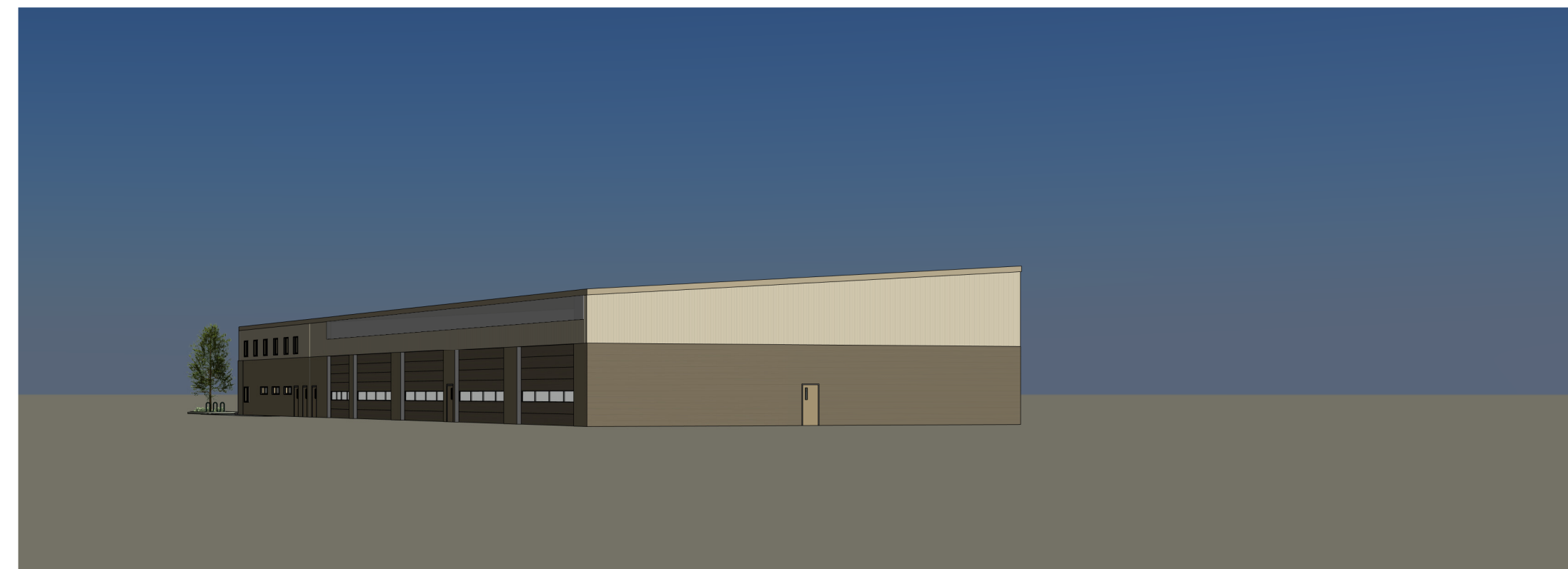
3 3D View - Southeast