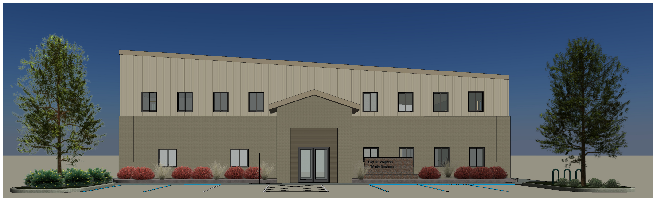
6 3D View West