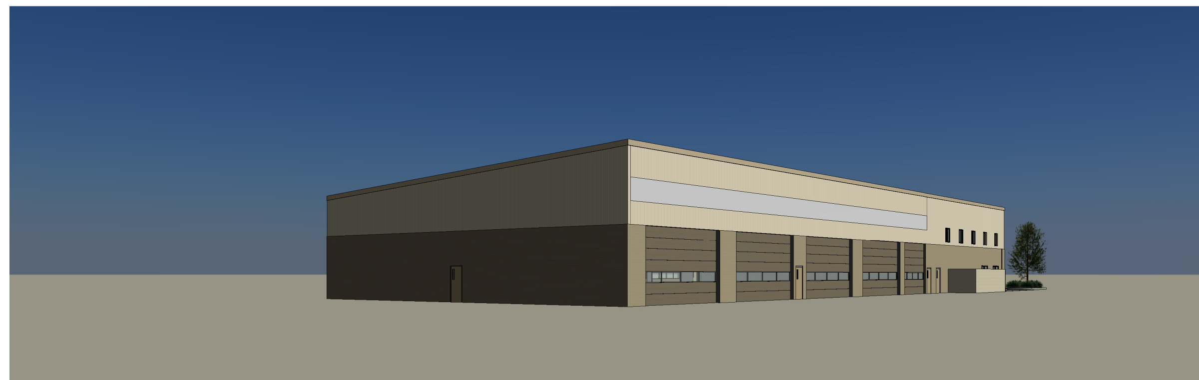
5 3D View Northeast