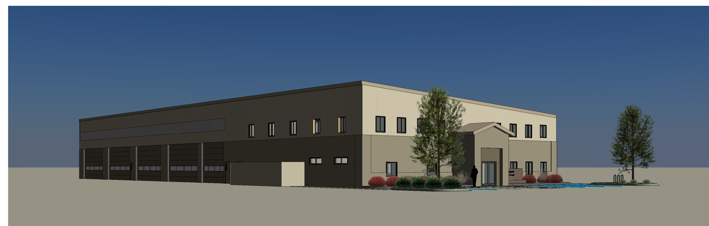
2 3D View - Northwest