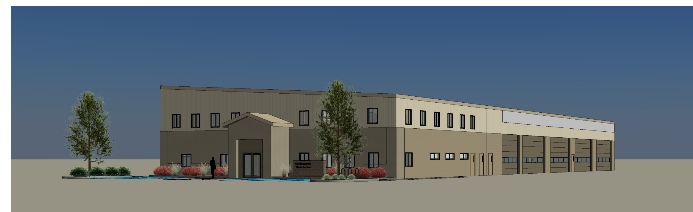
1 3D View - Southwest